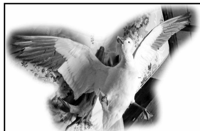
stuffed flying snow goose

piano stool glass ball feet Lionel train & track