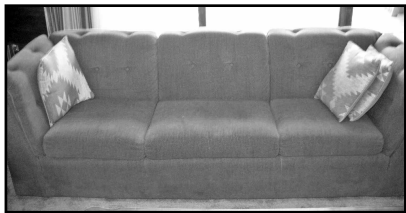
couch rocker recliner Pride lift chair glider rocker

LG 50" flat screen tv TV stand for above tv (2) Kenmore refrigerators (2) Kenmore chest deep freezers (3) bedroom sets